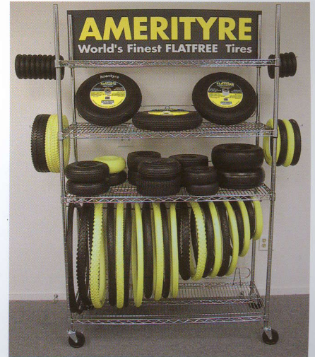
MADE IN THE USA